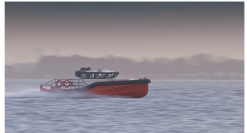
35 KNOTS / 4100 KGS BOLLARD PULL