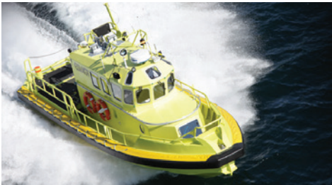
34 KNOTS / 4300 KG BOLLARD PULL

NAMJet's high-thrust, large-displacement systems, which are rated for speeds up to 35 knots dispels the common misconception that higher thrust can only be achieved by sacrificing speed.