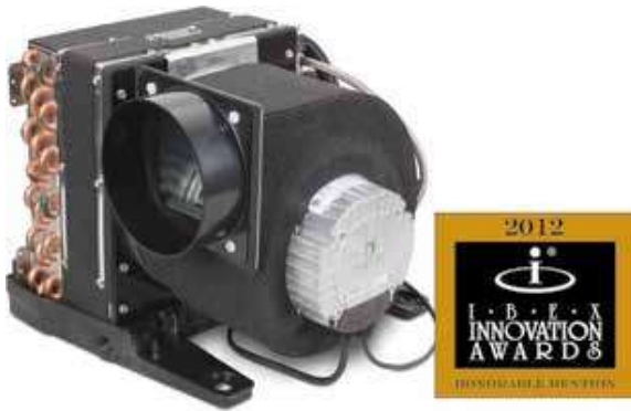
Gold AU12DCZ 12,000 BTU/hr 230V/50-60Hz chilled water air handler shown

Gold Series air handlers, recipient of an Honorable Mention at the 2012 International Boatbuilders Exhibition and Conference (IBEX), incorporate many innovative features, including an optional Breathe Easy™ air purifier and rust-free composite drain pan. AU-DC models feature ultra-quiet "WhisperCool" DC blowers that are strong enough to overcome high-static-pressure duct.