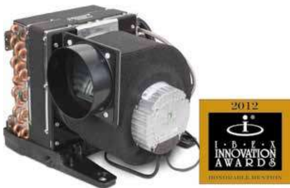
Gold AU12DCZ 12,000 BTU/hr 230V/50-60Hz chilled water air handler shown

Gold Series air handlers, recipient of an Honorable Mention at the 2012 International Boatbuilders Exhibition and Conference (IBEX), incorporate many innovative features, including an optional Breathe Easy™ air purifier and rust-free composite drain pan. AU-DC models feature ultra-quiet "WhisperCool" DC blowers that are strong enough to overcome high-static-pressure duct.