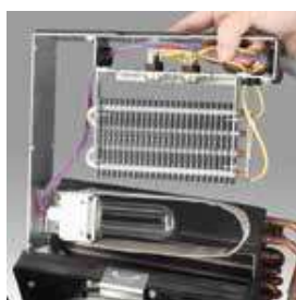
The assembly for the optional electric heater (top) and Breathe Easy air purifier (bottom) fits between the coil and blower (standard AU model shown).