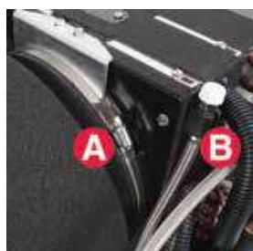
The DC blower can be easily rotated in the field by loosening the single adjustment screw (A) on the blower collar; air bleeder hose cradle (B) is also shown.