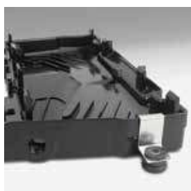
The drain pan features anti-slosh, positive-flow condensate channels, reinforced drain holes, and moveable vibration-isolation mounting clips.

An upgraded Gold series EU package is available. Please see reverse side for details.