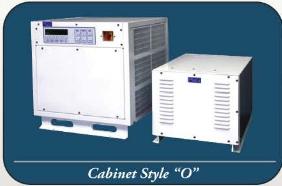
Cabinet Style "O"