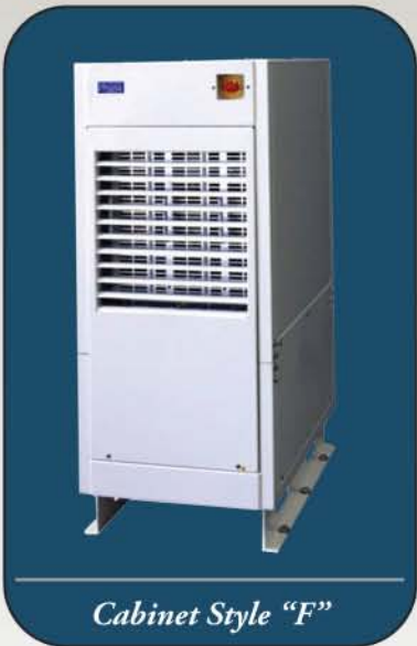
Cabinet Style "F"