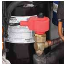
Electronic expansion valve for precise control of superheat.