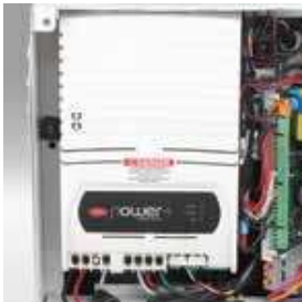
Built-in variable frequency drive.