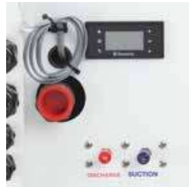
Integrated digital chiller control/display.