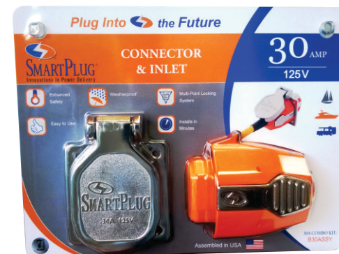
Part # B30ASSY