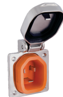
Part # BM30S