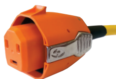
Part # BF30